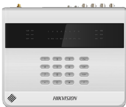
DS-19S08-04F/K1 or DS-19S08-04F/K1Gx

It is mainly applied to the security systems of shoppingmall, stores, residence, apartments, communities, etc. It can be used cooperatively with the video surveillance and access control subsystem through the software operation.