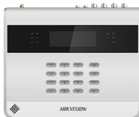
DS-19S08-04F/K2 or DS-19S08-04F/K2Gx