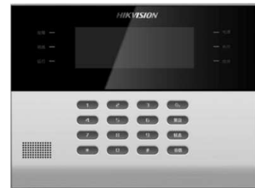
DS-19A08N-F/K1 or DS-19A08N-F/K1G

The control panel is mainly applied to shopping malls, stores, residences, apartments, communities and so on. It can push the real-time alarm information to the mobile app and implement the function of remote arming/disarming.