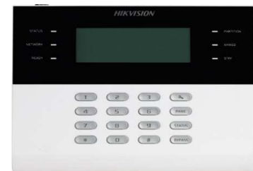
DS-19A08N-F/K2 Or DS-19A08N-F/K2G